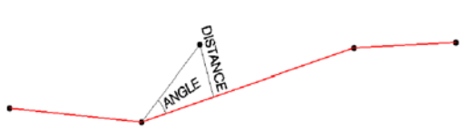
Figure 1: Terrascan iteration methodology.

There is also a maximum terrain angle constraint that determines the maximum terrain angle allowed within the model.